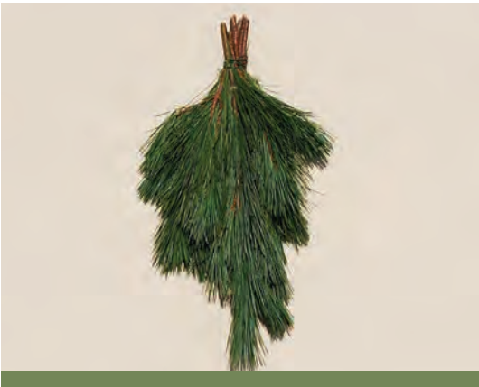
White Pine Bunch