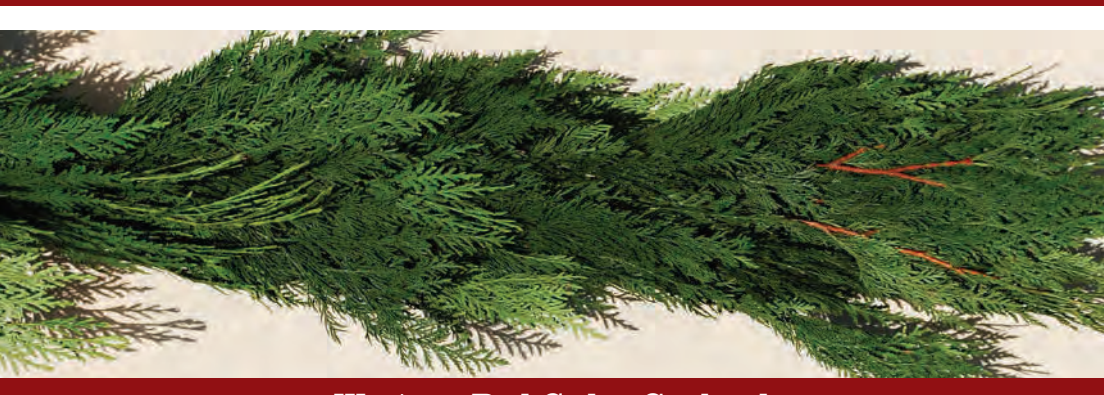
Western Red Cedar Garland

Western Red Cedar, Noble Fir, Berried Juniper