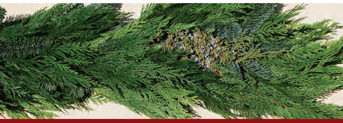
Mixed Western Red Cedar Garland

Western Red Cedar, Noble Fir, Berried Juniper