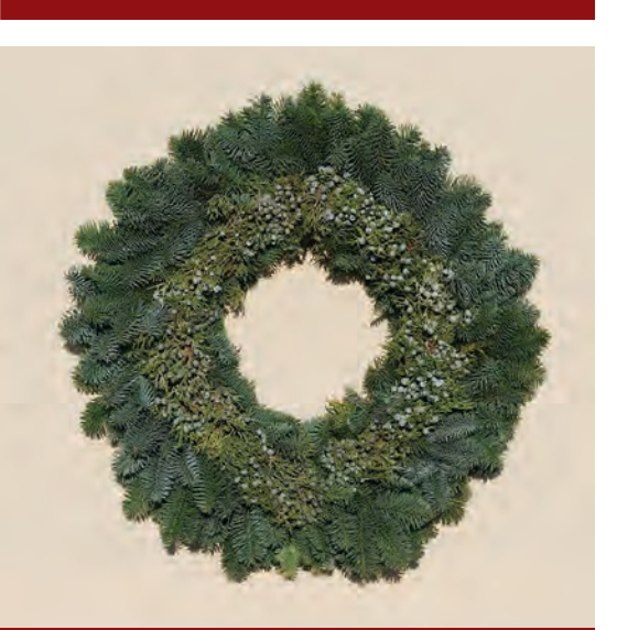
Noble Juniper Halo