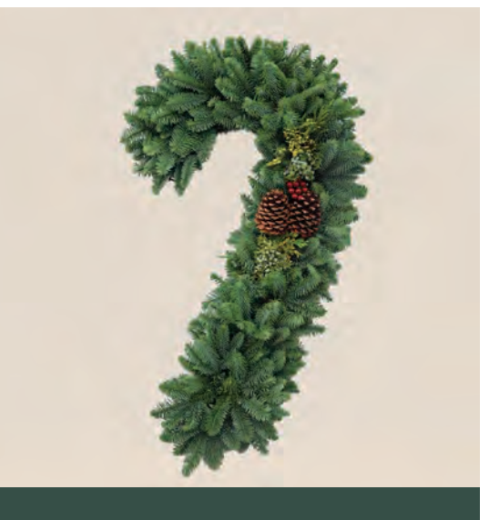
Candy Cane with Berries

Noble Fir, Incense Cedar, Berried Juniper, Red Berries, Pine Cones