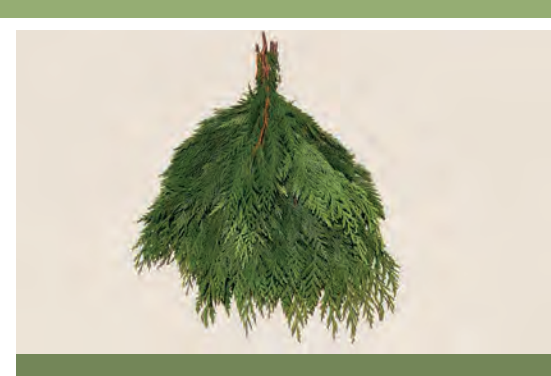
Western Red Cedar Bunch

All our products are hand-tied from wreaths to garlands to supreme mantelpieces. Hand tying cut greens holds them securely in place and creates a fuller appearance from every angle.