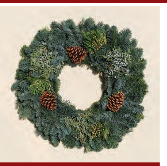
Mixed with Cones Wreath

Noble Fir, Incense Cedar, Berried Juniper, Pine Cones