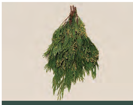
Incense Cedar Bunch