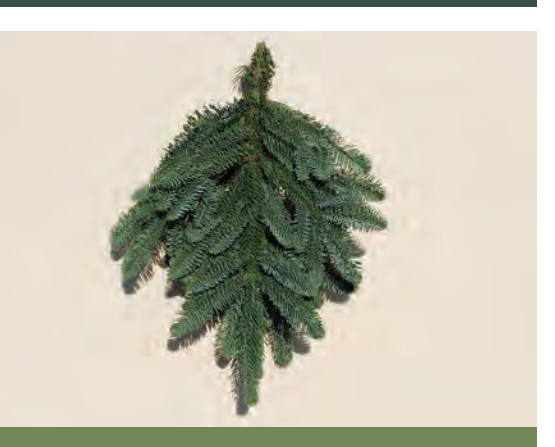
Noble Fir Bunch