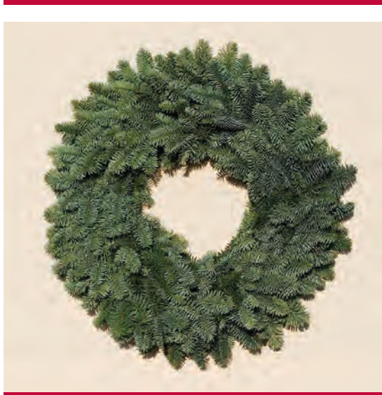
Plain Noble Fir Wreath